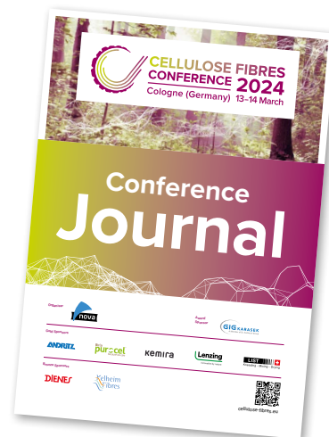
Cover Page of Last Year's Conference Journal DIN A4 • Print Edition: 300 • PDF Online Distribution